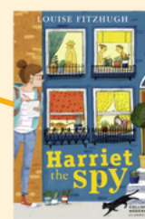
Harriet The Spy by Louise Fitzhugh